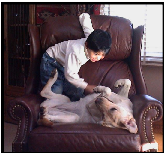
Sofie and our son hit if off from the start.

In his senior years, Chester “told” us that he needed a friend, someone who would be willing to lick his ears in exchange for some quality playtime with his toys. So one day we found Sofie at a local shelter – and together Chester and Crazy Sofie became the escape artists of all times, the welcoming committee of our neighborhood, two free spirits joyfully galloping through flower gardens and plowing through manicured lawns.