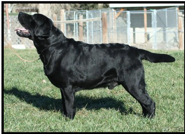
This is Fender when I first met him – 96 pounds of pure English Lab!

The following week, I was on my way to pick up Fender for his first obedience class when the breeder called: she had noticed about a month ago that he was limping so the veterinarian had x-rayed his shoulders and was suspecting osteochondritis dissecans , or “OCD”. Because OCD is a genetic disease in Labs, she couldn’t possibly use him as a stud and would have to remove him from the gene pool. Would we want to adopt him? I almost drove into a ditch. Was I dreaming? Has she just offered us her “top dog”? Spencer had left a huge void and just like that, someone was going to fill it... maybe. So I picked up Fender for his class and told the breeder that I would take him home afterwards to see if the rest of the family would accept the new candidate.